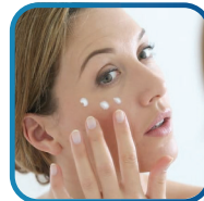
Apply skin cream according to doctor's instructions