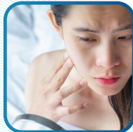
Avoid rubbing / scratching skin