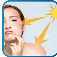
Avoid direct sunlight