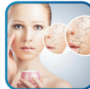
Avoid using skin exfoliating products right after peeling