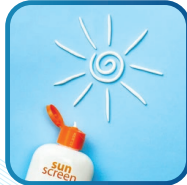
Use sunscreen or moisturizer regularly according to doctor's instructions